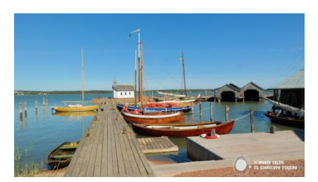
Mariehamn, Åland islands