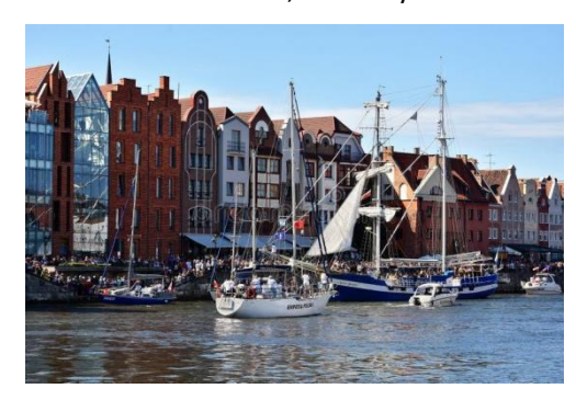
Baltic Sail Gdansk, Poland