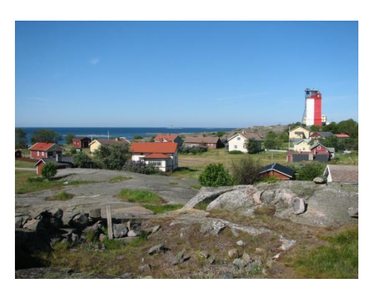
Utö island, Finnish archipelago