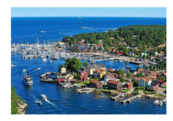
Sandhamn, Swedish archipelago