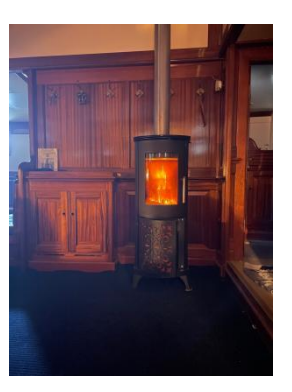
Spacious and comfortable dining table with and saloon. Complete modern galley for cooking.