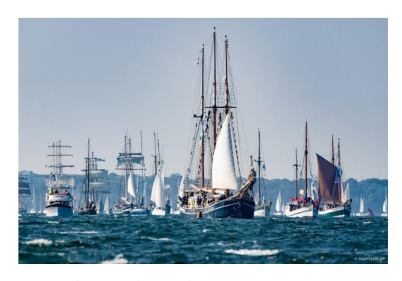
Kieler Woche, Kiel, Germany