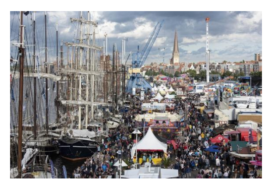
Hanse Sail Rostock, Germany